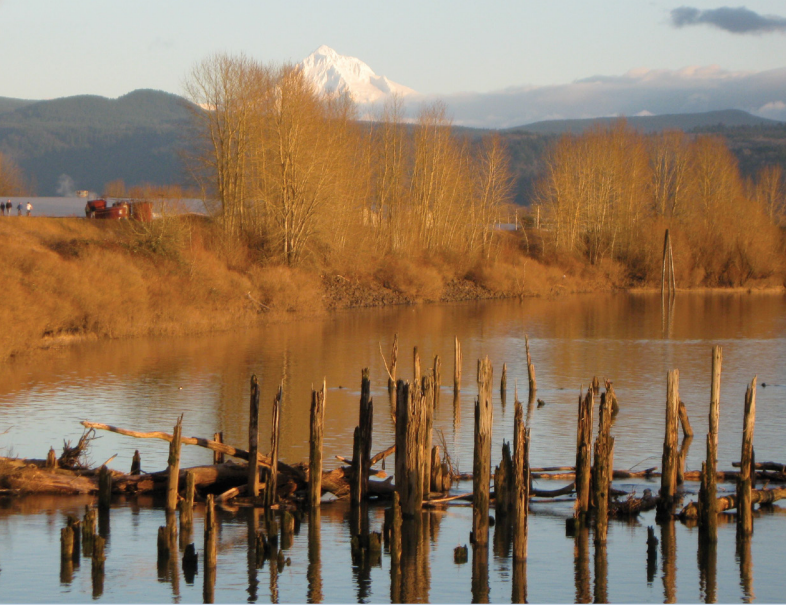
City of Washougal

WCIA has broadened its training mission to include strategic momentum as individual member training budgets become limited. It now extends to the membership's day-to-day training and staff development. With an administrative budget of $550,000 and a staff of three, the department annually trains approximately 7,000 member employees at 300 sites across the state. Topics range from regional geographical areas to stand-alone sessions exclusive to a single member.