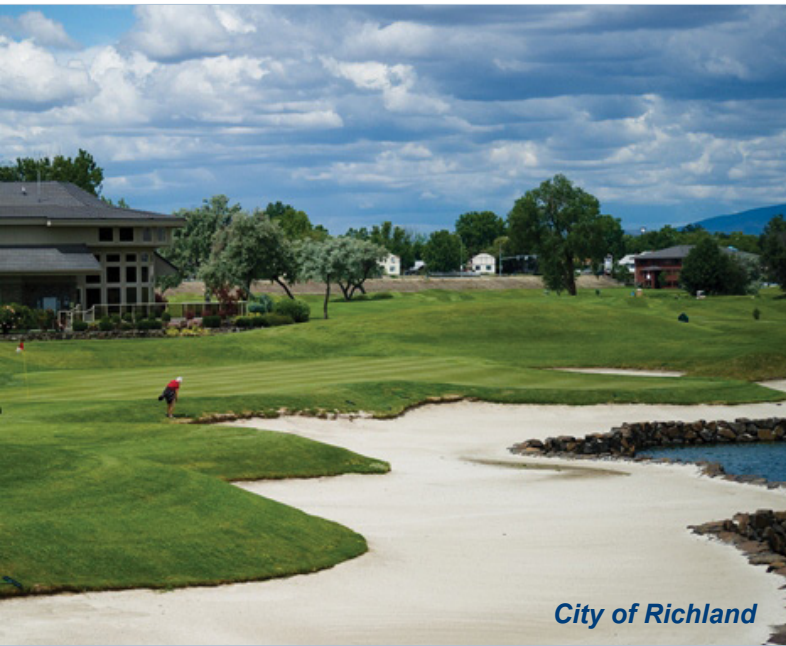
City of Richland

As the population of potential trainees declines, maintaining the program's volume and quality becomes a challenge. One solution utilizes partnerships with 19 municipal associations and three risk pools. This practice follows the municipal employee population as they assemble for professional development conferences. WCIA supports an association's attendance goals through scholarships and session speaker sponsorships, to a full-day pre-conference session on liability issues consistent with the conference's theme. The purpose is to collaborate rather than compete with the conference, improve the conferences potential success and facilitate our membership's own risk management and training. The pre-day sessions utilize the Authority's own litigation case results, such as an expansion of police liability crisis intervention training requirements.